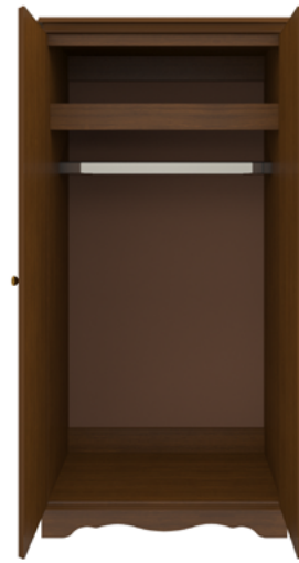
Model: CHWR02 34.5W 23.75D 71H

The Charlotte Collection is the perfect fit for any traditional senior living environment. Gently radiused corners and OG edging protects fragile skin, while the styling uplifts and restores the spirit. Raised cabinetry promises ease of cleaning below case goods. The product is required to be wall mounted for safety. Using the kit provided, please follow provided instructions exactly.